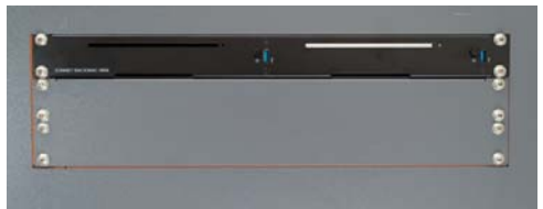
19" rack mount carries two Mac-PC's or easy access PC maintenance and exchange. External power switches