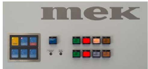
Conveyer operation panel to select operation modes and monitor AOI