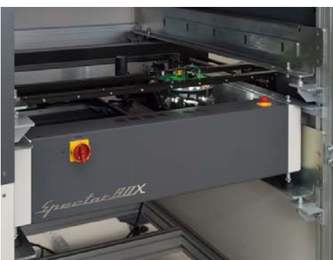
Levelling brackets for easy adjustment of the SpectorBOX focus and conveyer height. The levelling brackets allow single-person easy levelling, even with pre-mounted SpectorBOXes. Built-in mm-rulers integrated in the mainframe poles, allow easy pre-adjustment in advance of final levelling. The Top rail can hold an additional SpectorBOX for Top Down inspection. Equipped with the same level brackets to allow easy levelling and pre-adjustment.