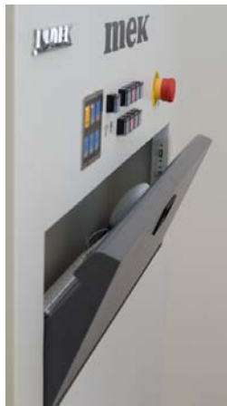
Keyboards and mouse's for fast stow away and return without wiring hassle