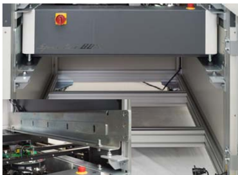
Nutek Mainframe holds 1 or 2 SpectorBOXes. The bottom unit can go as low as the factory floor by removing the bottom bars for inspection of solder joints from 280mm above the factory floor onwards.