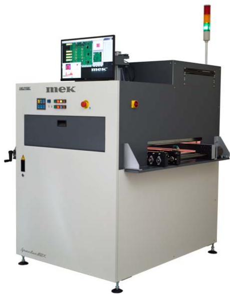
Ergonomic design with eye-height monitors and wrist height controls